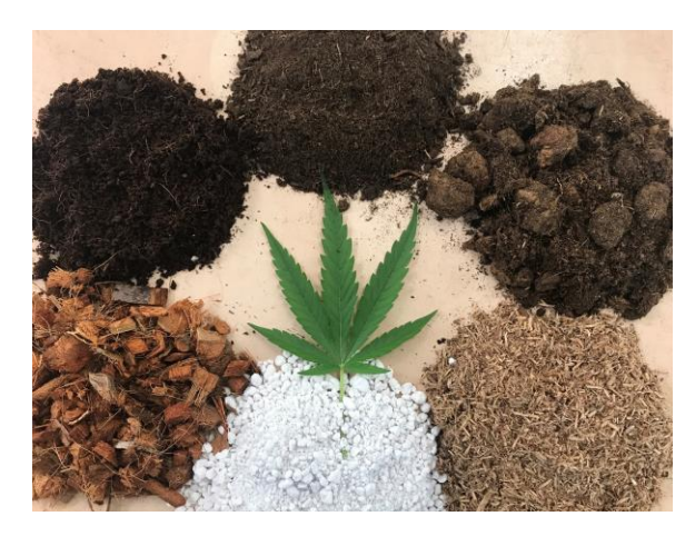
Figure 8. Indoor production of container-grown Cannabis relies on many different organic and inorganic growing media (substrate) components.

Current and future understanding of Cannabis -substrate interactions will increase drastically as more and more state institutions (and private) are allowed to research and study these crops. Grower trials and experimentation will also continue to provide reliable information about containerized Cannabis production. Growers can conduct accurate and reproducible trials at their operations. Research does not have to be conducted in a laboratory! The perfect balance of science and application exists in grower and researcher partnerships which has been the key to success for numerous other horticultural industries.