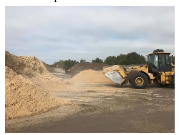
Figure 2. Success of many commercialized wood substrates has led to large-volume, mass production of materials for use in professional and retail products.

The majority of the wood products being commercialized are primarily made by one of three processes: 1) single or twinscrew extrusion; 2) twin disc refiners; or 3) hammer mills. The first two processes, used extensively throughout Europe, are thermomechanical techniques which involve high temperatures and friction to make the products. These technologies also exist here in the U.S. Wood products made with