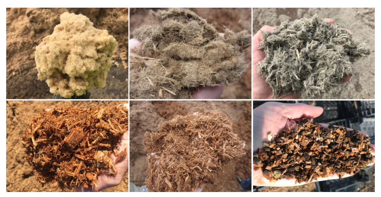
Figure 1. Wood substrate materials from European and North American manufacturers show variations in particle size and structure.