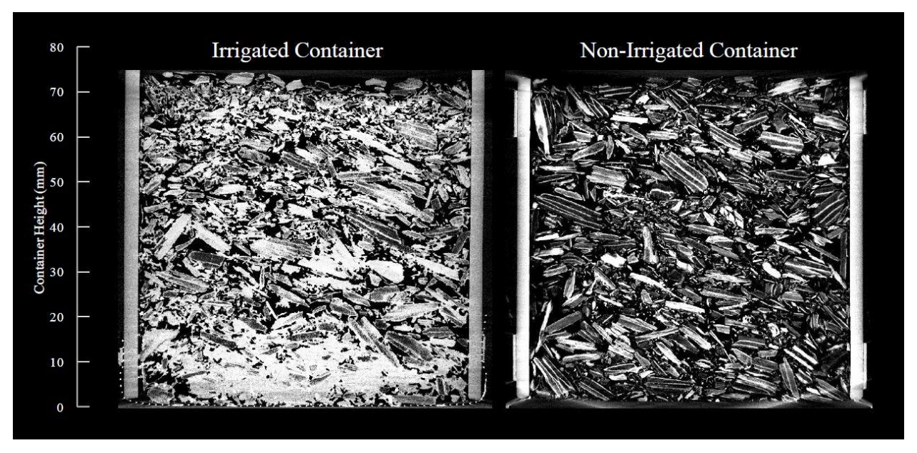
Figure 5. Pine bark cores were analyzed before and after irrigation. White or light grey objects indicate the presence of solids and water. Black spaces indicate air-filled regions.

what is apparent is the spatial distribution of water in the container. From this orientation, the layer of water held by capillary tension in the irrigated sample, commonly called the "zone of saturation," stands out in bright contrast from the non-irrigated sample (located between 0 and 20 mm; Figure 5).