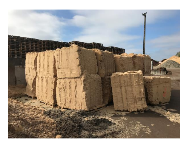
Figure 3. Some wood fiber materials can be easily compressed in different sized bales to aid in storage and transport.

There has been a tremendous amount of research conducted on wood substrates and substrate components over the past decade. The data and observations generated from those trials has been the foundation to all that we know today about the uses and potential of these substrate materials. While previous data is valid and has answered many questions (while generating many more), the learning curve for how to properly research, evaluate, and characterize these materials has been steep. As we understand more and more about the physical, chemical, hydrological, and biological properties of wood materials we have to continually evolve how we conduct our substrate research.